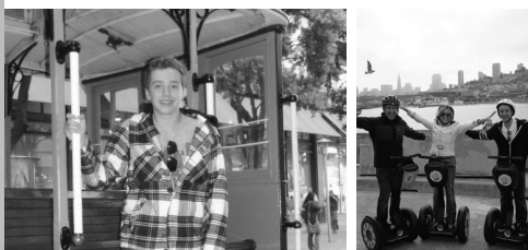
RIGHT: SAN FRANCISCO'S SEGWAY