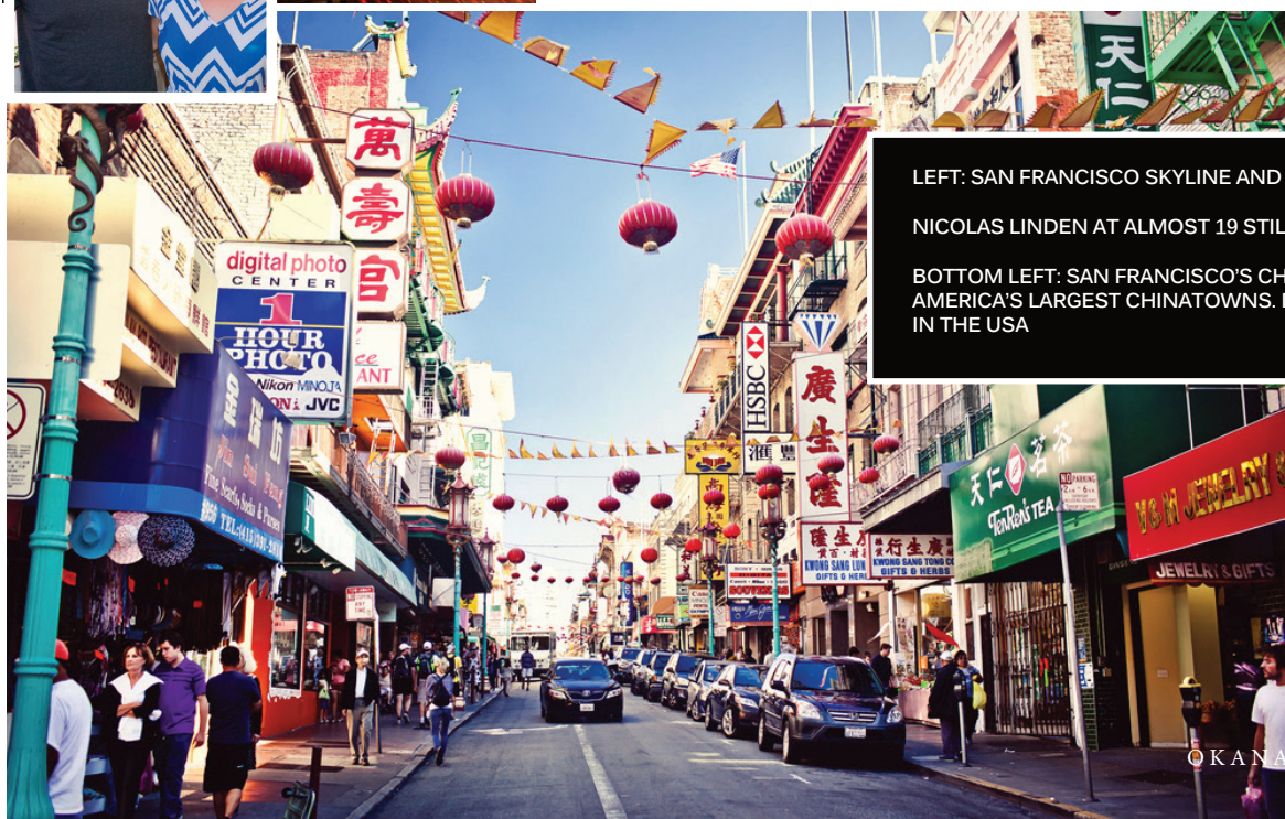
BOTTOM LEFT: SAN FRANCISCO'S CHINATOWN IS ONE OF NORTH AMERICA'S LARGEST CHINATOWNS. IT IS ALSO THE OLDEST CHINATOWN IN THE USA