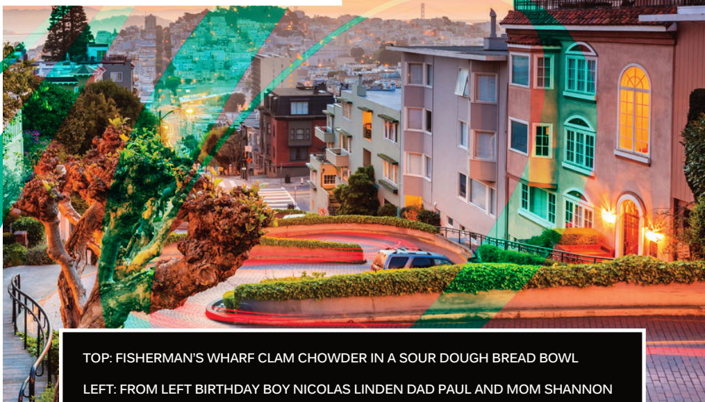
TOP: FISHERMAN'S WHARF CLAM CHOWDER IN A SOUR DOUGH BREAD BOWL